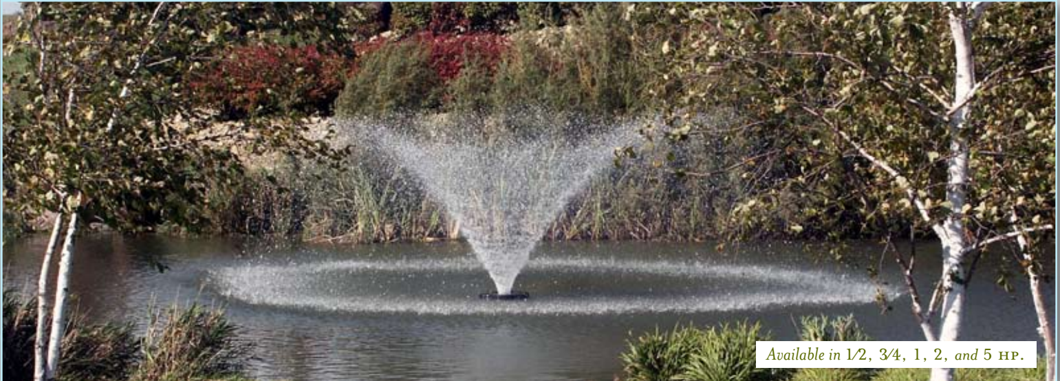
Available in 1/2, 3/4, 1, 2, and 5 HP.

FOR OVER 4 DECADES, KASCO HAS BEEN MANUFACTURING AERATION PRODUCTS PROUDLY IN THE U.S.A. OUR CUSTOMER-FOCUSED PHILOSOPHY ENSURES THAT YOU GET SUPERIOR PERFORMANCE AT A GREAT VALUE. IMPROVE THE OVERALL WATER QUALITY AND SMELL OF YOUR POND, WHILE ENHANCING ITS APPEARANCE.