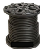
Alpine™ 3/4" Weighted Airline