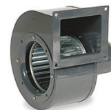
6.17HP Oilless Regenerative Blower

Electrical panel and blower rated for outdoor installation, blower mounted on galvanized steel pallet all-welded construction outdoor/industrial rated, ready to set and connect. Control panel shipped loose for site installation on power pedestal by customer's electrician. System includes fittings and clamps to install 3/4" Alpine™ Weighted Tubing and Diffusers. Includes clamps and fittings to connect 3/4" Adaptaflex to 3/4" Alpine™ Self Weighted Tubing at toe of berm (in most cases). Installation, customer to provide 2" End Welded Air Distribution Trunk Manifold and 3/4" Airflow Adjustment (Ball) Valves (Qty. 20) with Male Adapter (3/4" Npt X 3/4" Spiral Barb) for each Airflow Outlet on Trunk Manifold.